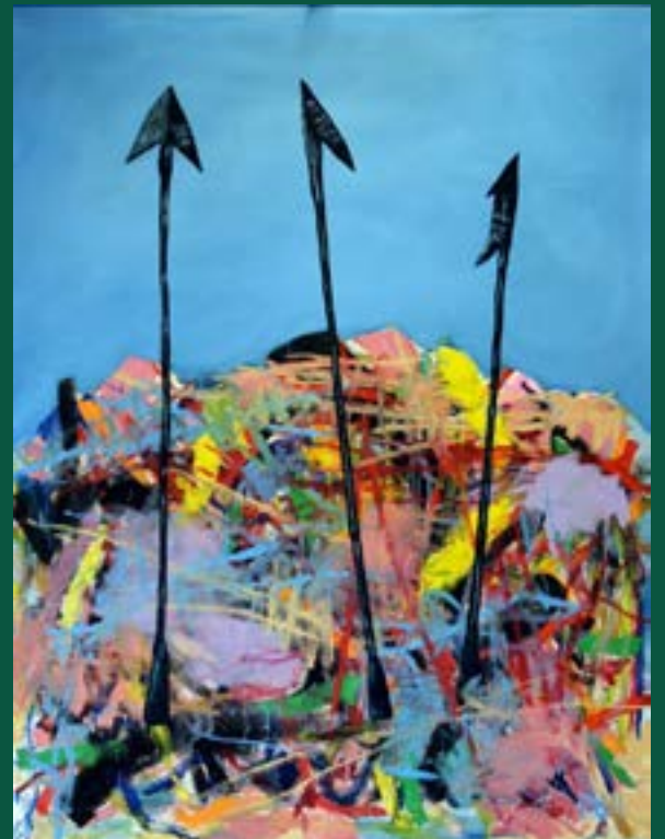
"Weapons of Mass Destruction", Oil on Canvas