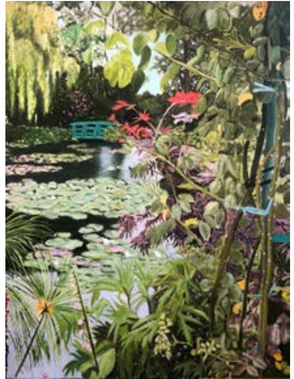
"Ode to Monet", Oil on Canvas