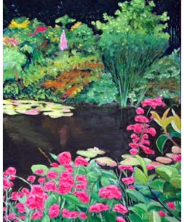
"Flowers Near the Pond", Oil on Canvas