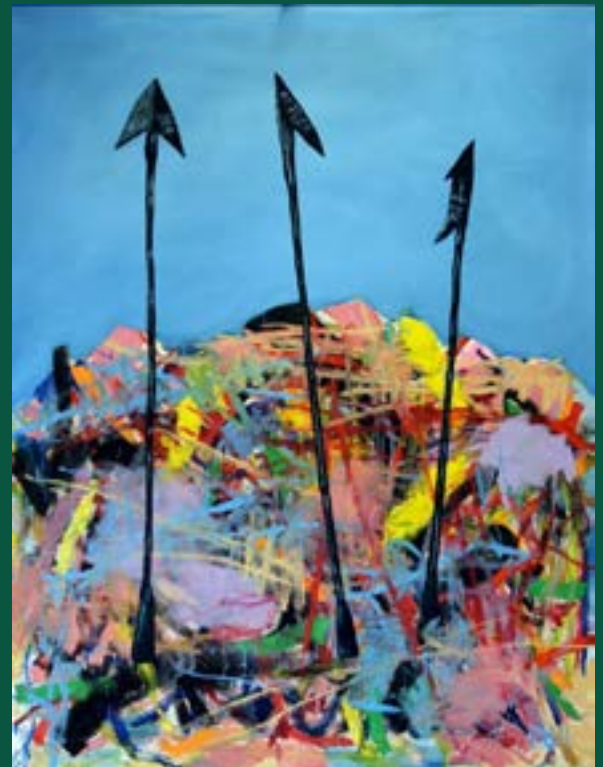
"Weapons of Mass Destruction", Oil on Canvas